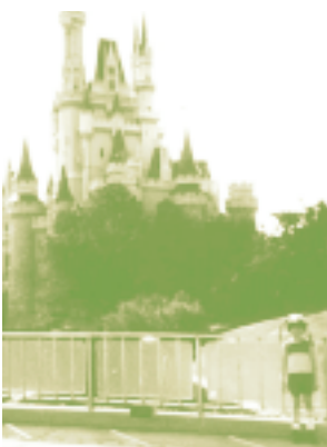
Disney's Enchanted Castle

In Palm Beach/Boca Raton you can find: endless stretches of pristine beaches! The latest in fashion and shopping! Dozens of golf courses! African wildlife in Lion Country! Romantic scenery and festive nightlife!