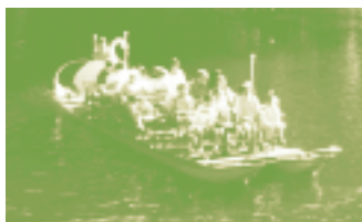
Swan Boats Boston Common

Visit "Old Cape Cod" with its quaint towns and white, sandy beaches and don't forget the "lobster!" Take a day trip to sites in New Hampshire, Maine or Connecticut, and for a change of pace a most interesting day - try skiing!