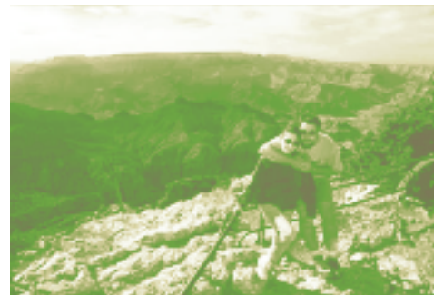
Grand Canyon's Beauty

For more information, email Phoenix@alp-online.com