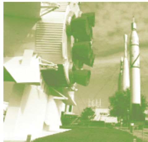
Kennedy Space Center

For more information, email Orlando@alp-online.com or PalmBeach@alp-online.com