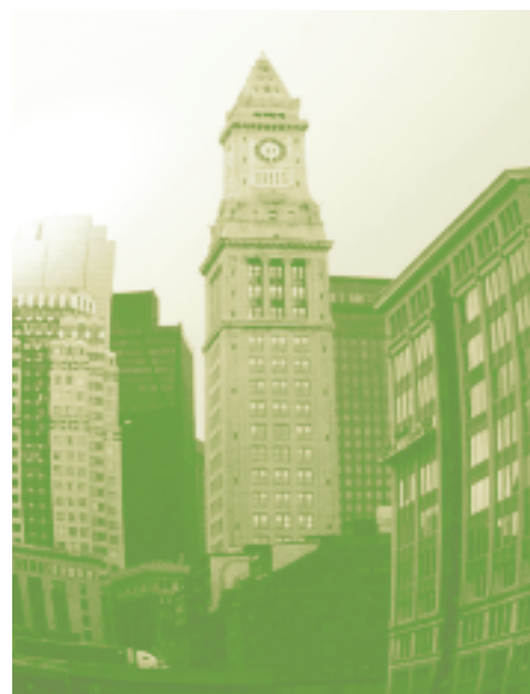
Custom House, Boston

For more information, email Boston@alp-online.com