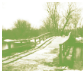
The Old North Bridge in Historical Concord, MA

► Massachusetts welcomes you to one of America's oldest cities, Boston, Massachusetts - America's Walking City! Follow the Freedom Trail (red line) and see the sites of America's earliest history! Visit Fenway Park (Boston Red Sox Major League Baseball). Stroll down brick sidewalks in Boston's Back Bay known for its charming brownstone buildings! Shop in elegance on fashionable Newbury Street! Spend some time in Boston Commons: two scenic parks in the heart of downtown Boston complete with swan boats and an ice rink! Have a hearty Italian dinner in the North End and, view the Tall Ships docked in Charlestown Navy yard (see the USS Constitution)!